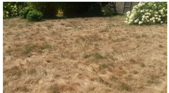
A healthy, but dormant, lawn.

Dormant turf that is subject to excessive wear can suffer irreparable damage. Since grasses are not actively growing when they are dormant, they are not able to compete with pests and become more susceptible to weed invasion . Also, damage from insect and disease injury may not be easily detected because the turf is already off-color (brown). The areas of turfgrass loss would be detected once rain, and thus growth, resumes.