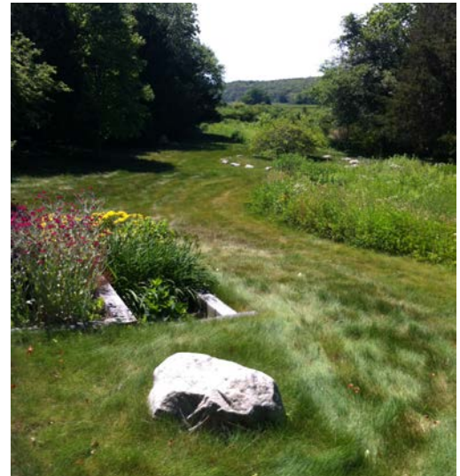
A healthy, established lawn requires irrigation only once it exhibits observable symptoms of drought stress.

A dense, healthy stand of turf is a net benefit to the environment if grown in a sustainable way. Most established home lawns don't need to be watered frequently and can survive with natural rain events or with limited irrigation. Cool season turfgrass lawns that are not irrigated will naturally go dormant in the summer, and recover when adequate moisture returns in the fall. Lawns that are irrigated should be watered deeply and infrequently throughout the summer, optimally when turfgrass begins to show signs of drought stress. Turfgrasses that are irrigated based on their need for water, rather than on an arbitrary schedule, will develop stronger roots, in order to seek water located more deeply in the soil profile, creating a thicker, healthier lawn.