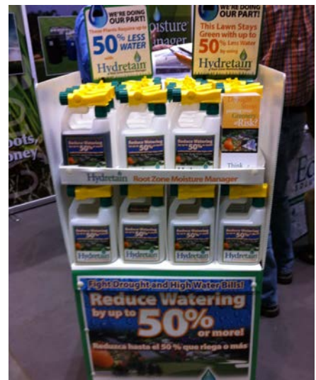
An example of a wetting agent available for purchase. (Not an endorsement of this particular product.)

Wetting agents can be used to increase the amount of water that penetrates into the thatch and soil to make water more available to grass roots. A wetting agent is a surfactant that can be added to irrigation water to reduce its surface tension, allowing for a better distribution and penetration of water through the soil. They can be applied in a liquid or granular form, and can be watered in or applied through the irrigation system. Wetting agents are commonly used by turfgrass professionals, such as golf course superintendents and sports turf managers as a regular component of their turfgrass maintenance programs.